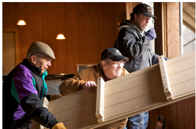
Installing the new shutters on the dancehall.

Thanks to the hard work of our founding members, we have a wonderful organization that we can all be proud of. We own what we all consider to be the best lake in Oakland County. We have beautiful forest lands. We have a nearly 85-year history of cultural events and tradition. And we have acres of recreational land available for our year-round use. We must all work together to maintain and enhance what we have in order to save it for future generations of Finnish-Americans.