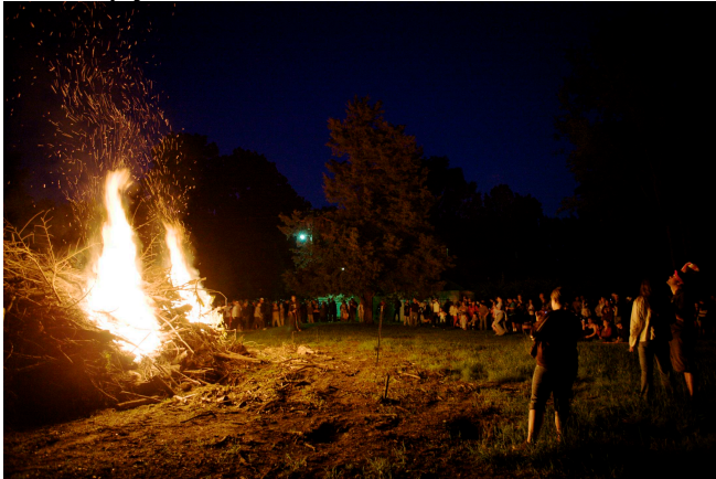
Kokko at Juhannus 2008.