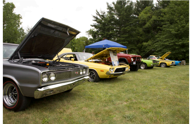
Cars lineup at Juhannus 2008.

Rain or shine, the third annual Finn Camp Car Show will take place on June 20, tying in with Juhannus. Registration is from 10 a.m. to noon; show time, noon to 5 p.m. Award and raffle time is 4 p.m. There is a $5 registration fee at the gate. Goodie bags will be available for the first 50 cars. There will be food on site, music and a cash bar, with later the lighting of the kokko (bonfire), something you do not want to miss. Come one, come all, and bring your classic car.