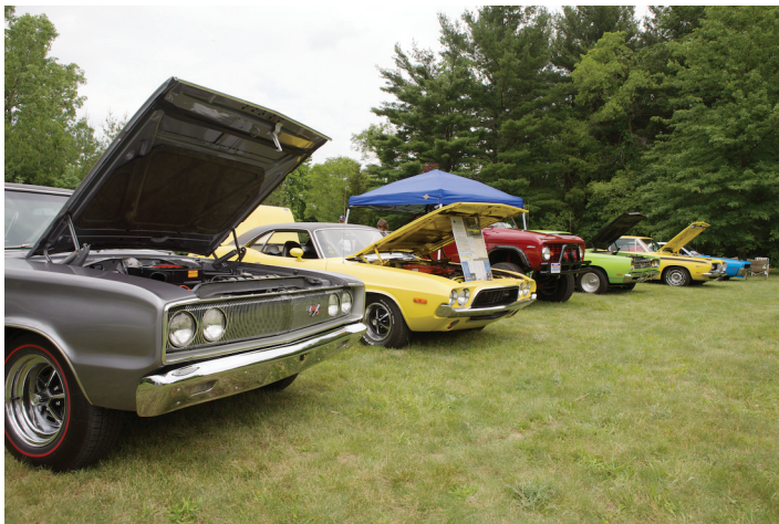
Finn Camp Car Show 2008

This year the annual car show will be held June 19, noon to 5:00 p.m., as part of the Juhannus celebration. There's no charge to view the Finn Camp's softball field full of meticulously reconditioned classic cars. In fact, for only $5 you can enter your own vehicle, in whatever level of completion you have reached with it.