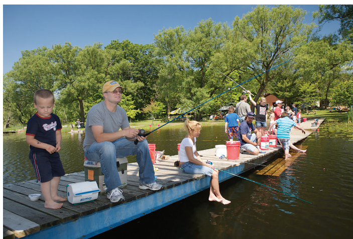
Fishing Derby 2009

Mark your calendar for Sunday, June 13: it could be your lucky day. Come alone, with a friend or bring the family. (This event is for members and guests only.) Registration starts at 9 a.m., the fishing begins at ten and lunch is about noon. Fish for hours, enjoy a freshly cooked fish-and-chip lunch—and maybe even win a great prize! There will be games and raffles for young and old. If you're not into fishing, come and volunteer, to gain some work hours. Donations of salad, fruit, veggies or dessert will really be appreciated to round out what will already be a great meal. For only $4 per person, how can you go wrong?