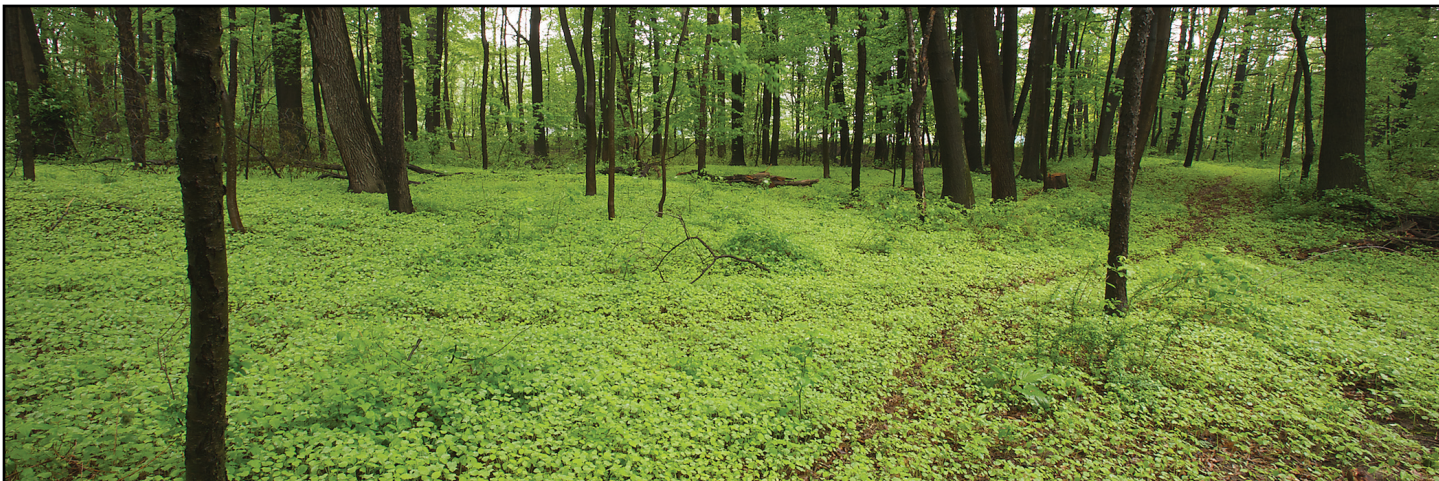
This spring's forest undergrowth is the lushest we've seen.