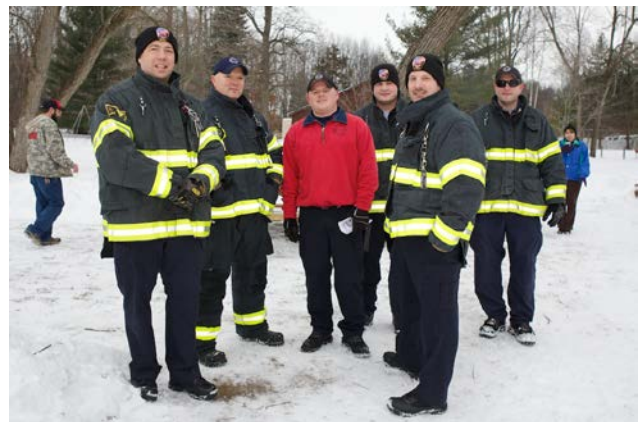
Thanks to the Wixom Fire Department for helping out at Winterfest 2011