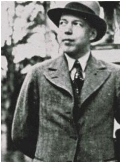
Mika Waltari.

Waltari, Mika (Toimi) (1908–1979). This lifelong resident of Helsinki (except for a brief stint in Paris) achieved international stature with his best-selling historical novel The Egyptian (1949) and others that were equally well written if not as successful commercially, like The Wanderer (1951). The first, titled in Finnish Sinuhe, egyptiläinen , became a lavish 1954 Hollywood movie about life in Egypt a