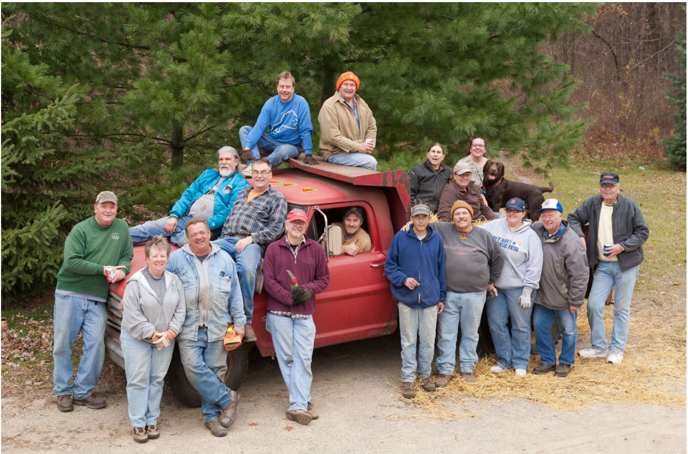
The work crew for Japanese bittersweet eradication and the regular Forest Management Committee was well attended on Sunday, November 13. They got a lot of work done. The photo above shows only some of the members who worked that day.