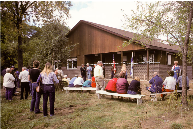
The new sauna building at its dedication in 1982.

Need a Seamstress? Call Cindi Maddick for all your alterations, custom work and mending at 248-303-7337.