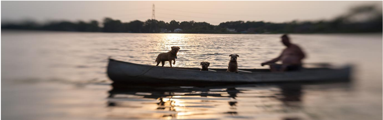
Last days of summer.