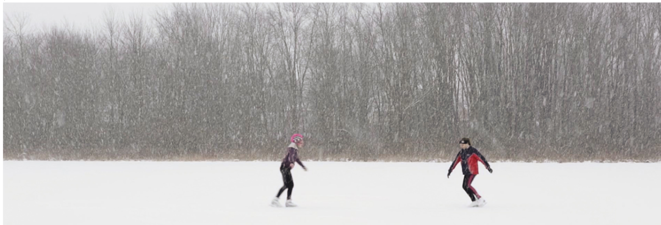
Members enjoying Winterfest on Sun Lake.