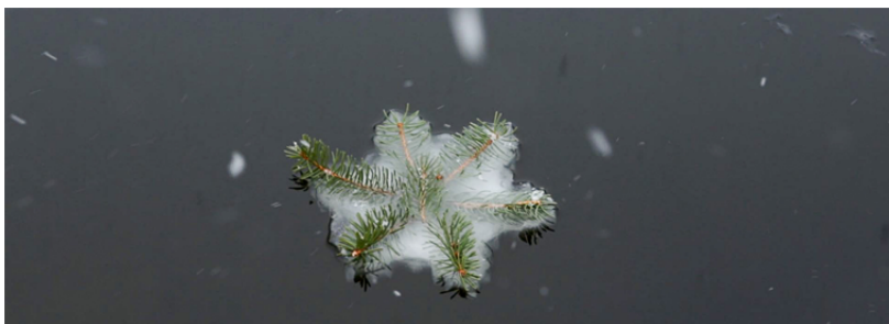
A six-pointed evergreen star on Sun Lake.