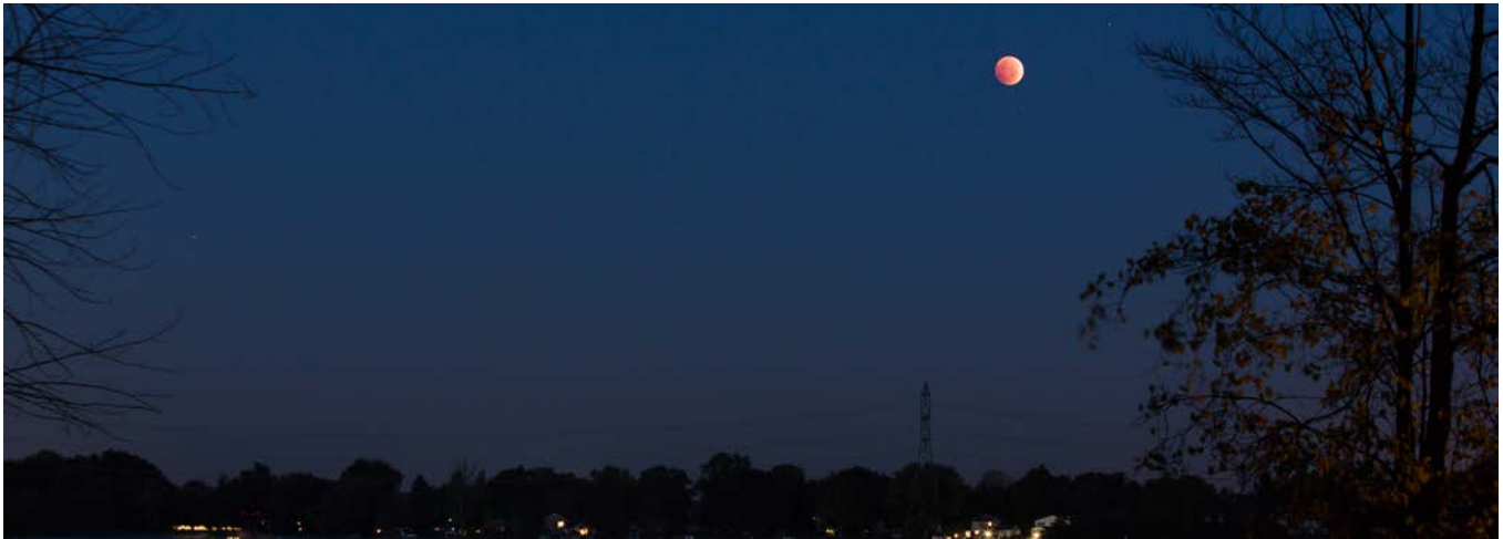
Total lunar eclipse on October 8: early morning over Loon Lake.