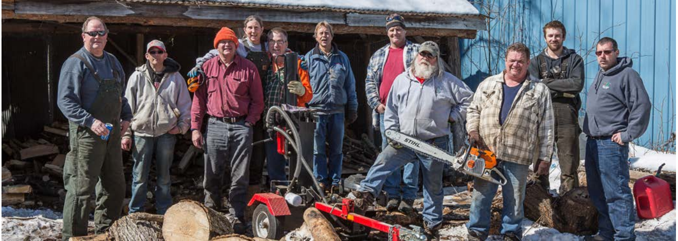
The Forest Management Committee paused for a breather on a balmy March 8.