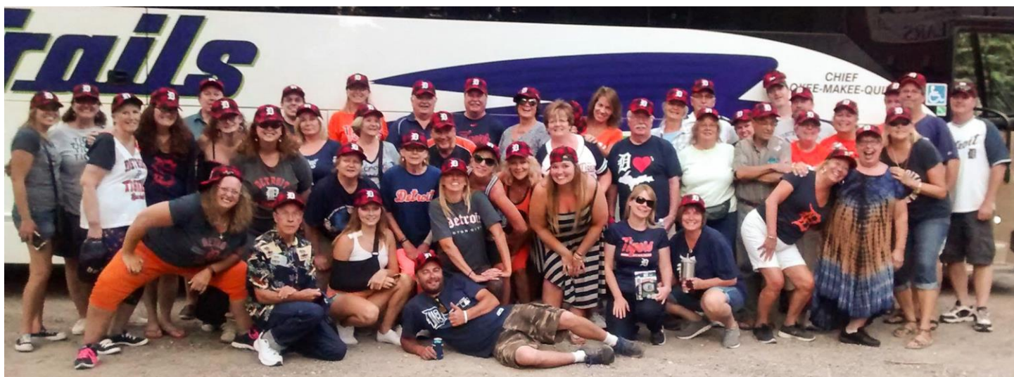
Detroit Tigers Yooper Night at Comerica Park on August 19.