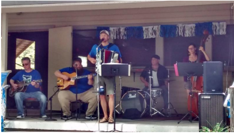
PasiCats performing on the dancehall front porch stage during Finn Fest