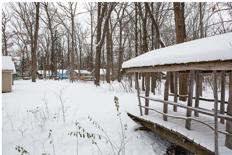
Michigan Winter in Camp Country