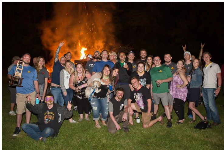
Finn Camp members and guests enjoy the Kokko at Juhannus 2019