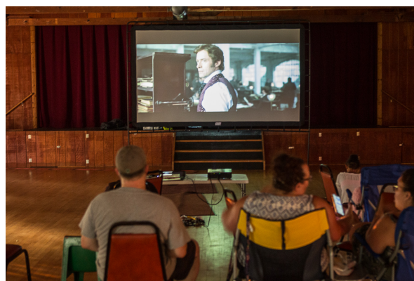
Family Movie Night on July 27 had Dumbo and The Greatest Showman movies.