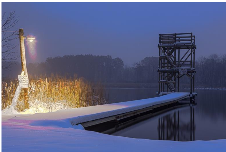
First snowfall on Sun Lake