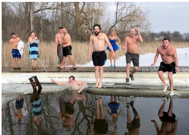
Polar plunge during Winterfest 2019.