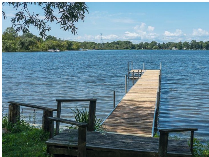
New dock recently installed at Loon Lake.