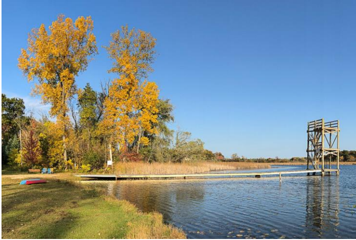
Sun Lake in the fall.