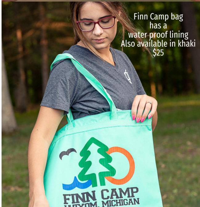
Finn Camp bag has a water proof lining Also available in khaki $25