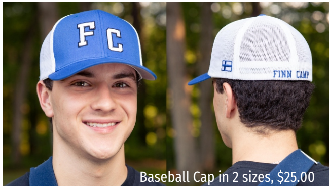
Baseball Cap in 2 sizes, $25.00

Come shop at the Finn Camp store. Lots of new tee shirts, mugs, hats & backpacks. For access to the store during off hours, call Patti Leppi, Ph: 248-921-1432, or email, Store@finncamp.org .