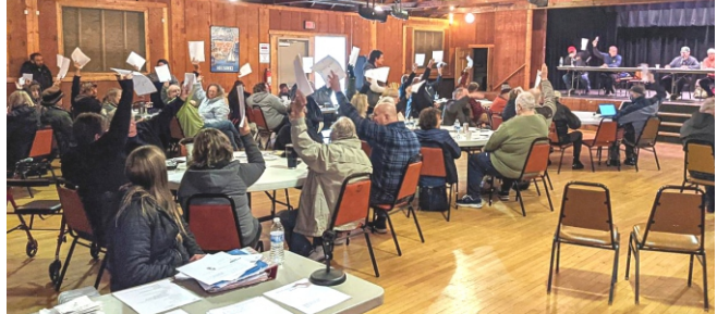
Voting at the semiannual meeting on October 24, 2021.