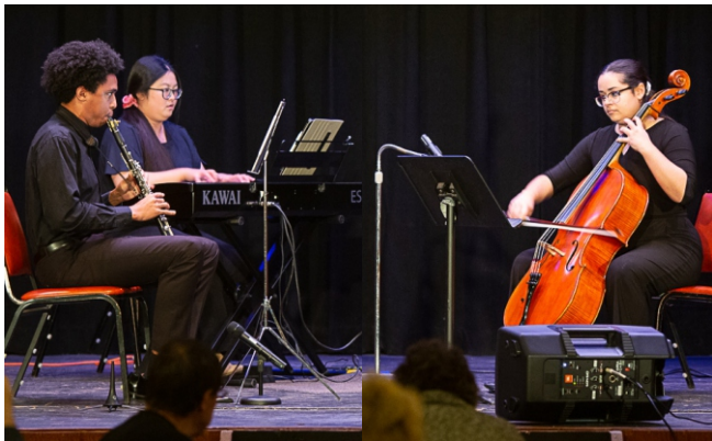
The Bowery Trio.

The Finn Camp hosted the Finlandia Foundation National on Saturday, October 16 th . The Finlandia Foundation National is a non-profit philanthropic, Finnish - American organization based out of Pasadena, CA. The Finlandia Foundation National (FFN) has 58 affiliated chapters across the U.S. The board members flew in from all over the United States for the event. A few Finn Center members attended the event as well. A camp tour was given to our visitors. The group also toured the grounds, sauna, Sun Lake, the clubroom and the dance hall. The Finn Hoppers performed, as well as a classically trained group called the Bowery Trio. Dinner was served in the