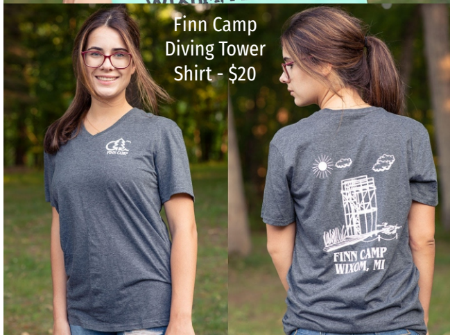
Finn Camp Diving Tower Shirt - $20