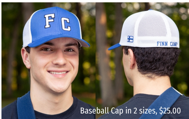
Baseball Cap in 2 sizes, $25.00

Come shop at the Finn Camp store. Lots of new tee shirts, mugs, hats & backpacks. For access to the store during off hours, call Patti Leppi, Ph: 248-921-1432, or email, Store@finncamp.org .