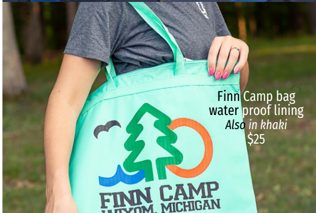
Finn Camp bag water proof lining Also in khaki $25