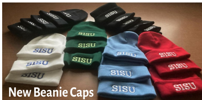
New Beanie Caps