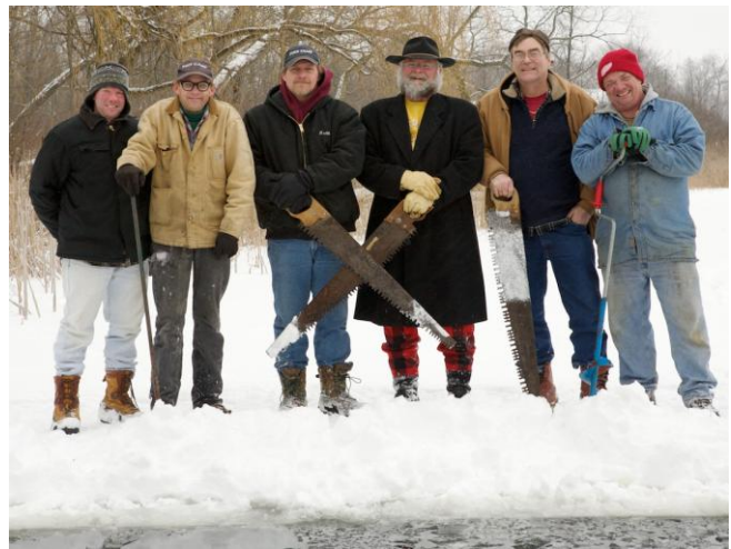
The ice-cutting crew from a previous Winterfest.

A euchre tournament will start at 8:00 p.m., and you can feel free to bring other games as well. In addition, a silent auction will be held. We hope to see everyone there!