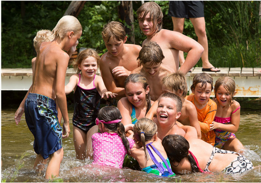
Children's Weekend. The other main event then was this year's play, "Aladdin," shown on page 1 at the curtain call.