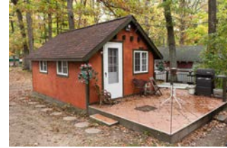
Camp 103, West Side

Charming cottage-style cabin of high-end materials: real stucco exterior, terra-cotta tile, Old World textured walls and ceiling. Under-cabin storage conceals yard tools, larger patio items. Fully decorated. $6,000 cash, OBO. For a tour or more information, call Crystal: 310-990-8509.